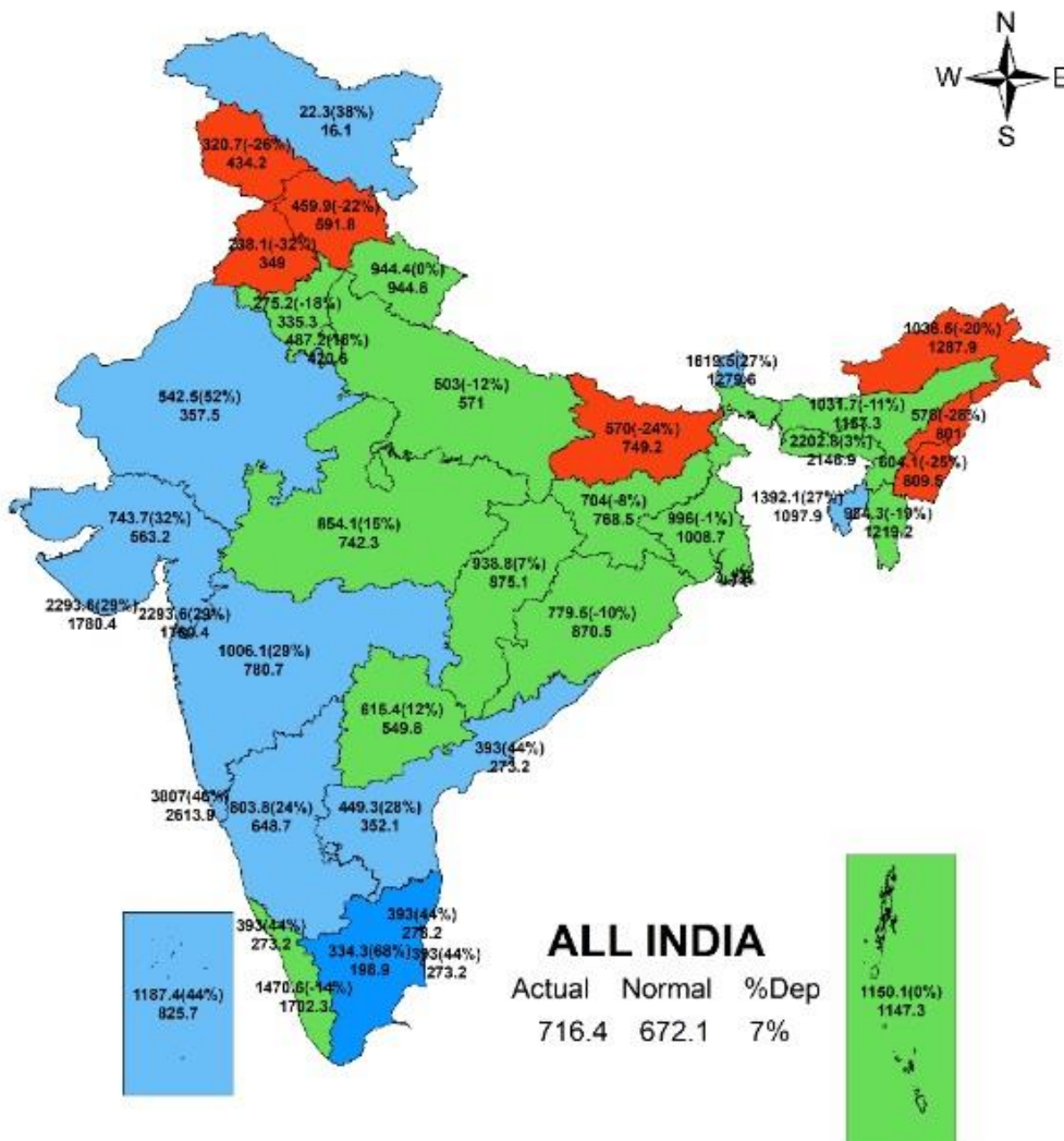
Fig 1: Distribution pattern of South-West Monsoon

Period from 1 Jun-12 Aug 2024