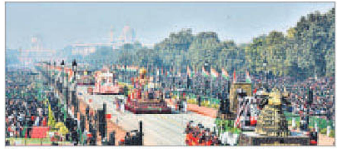
The tableau proposed by Delhi did not meet the selection cut, officials aware of the matter said.

In 2022, for instance, chief ministers Mamata Banerjee and MK Stalin expressed disappointment over the Centre rejecting the tableaux of their