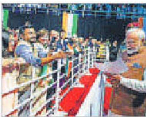
PM Modi signs autographs at the event on Saturday.

Kuwait is India's sixth largest crude supplier and fourth largest LPG supplier, meeting 3% of the country's energy needs, while investments by the Kuwait