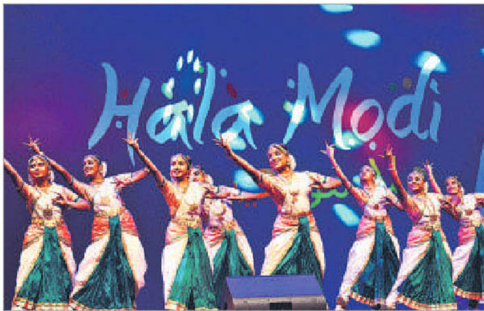
Artists perform during the event organised for PM Narendra Modi in Kuwait on Saturday.